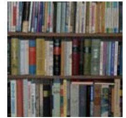
books by robina

What this means is that if you have a habit, for example, that habit is taking up a certain amount of space on the mental bookshelf, a certain amount of real estate in Downtown Brain, and in order to create a new habit you have to do something to shift the old one.