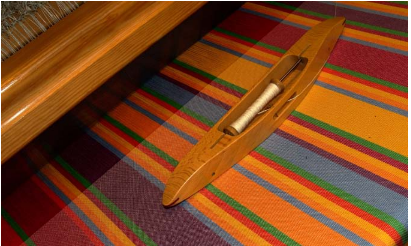
Fabric on a gauze

We find it hard to change because our brains are always fully committed to the patterns that they already have. To change those patterns, we need to pay attention to what we're doing and focus on new patterns that will work better for us.