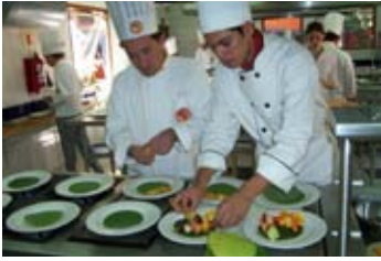
Chefs In Action

You may have heard that we only use 10% of our brains. (You may even have seen the saying incorrectly attributed to Albert Einstein.) Of course, it isn't true; we use all of our brain at one time or another, though usually much less than 10% of it at any one time. And this is one reason that it's sometimes hard to change our behavior.