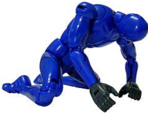
Emotion figures by Fuyoh!

Managing moods and emotions is something that many of us struggle with. Sometimes it seems like every day something happens that instantly triggers off fear, anxiety, anger, frustration, sadness, despair, guilt or shame. But with a simple technique, you can start managing those emotional hijacks and bringing them under your control.