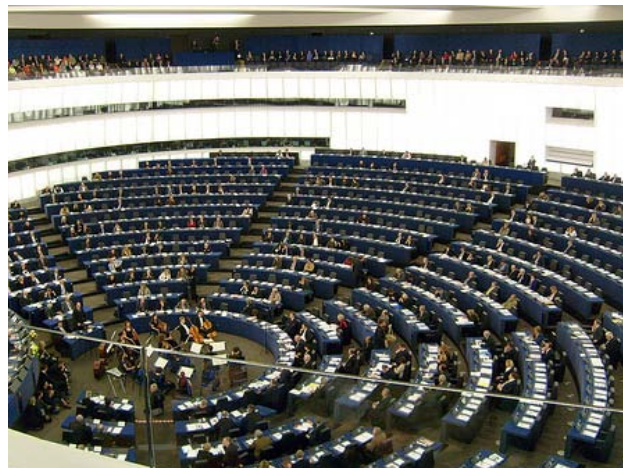
European Parliament, Strasbourg by inyuch

Member for Sadness: Chocolate! I will have chocolate!