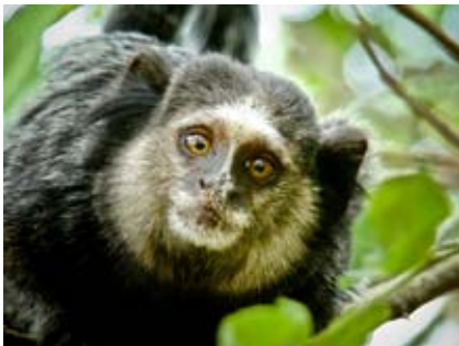
Mico - Saguí by Auroquero

Something like paying attention . An excellent book on brain plasticity for intelligent laypeople is Sharon Begley's Train Your Mind, Change Your Brain , which spends a lot of time discussing the power of attention. It describes, for example, a fascinating experiment with monkeys.