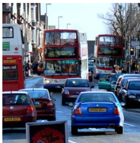
High Street by CmdrGravy

What you may find after practicing for a while is that you are starting to let go of the more superficial responses you have been making in the past, and that buried parts of yourself are emerging. They may be angry or unhappy parts. Let the emotions come, and let them go, just like wind passing over the grass. If you don't pump more energy into them by offering them resistance, they will dissipate by themselves in time. It may help to name them before letting them go.